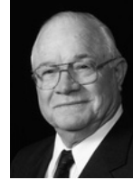
Louis Lloyd Lighthouse