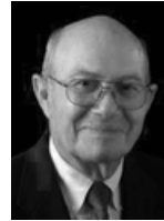
Gaylord Groce Lighthouse