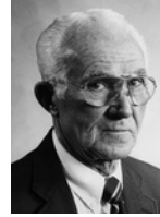
Richard Deaf Smith